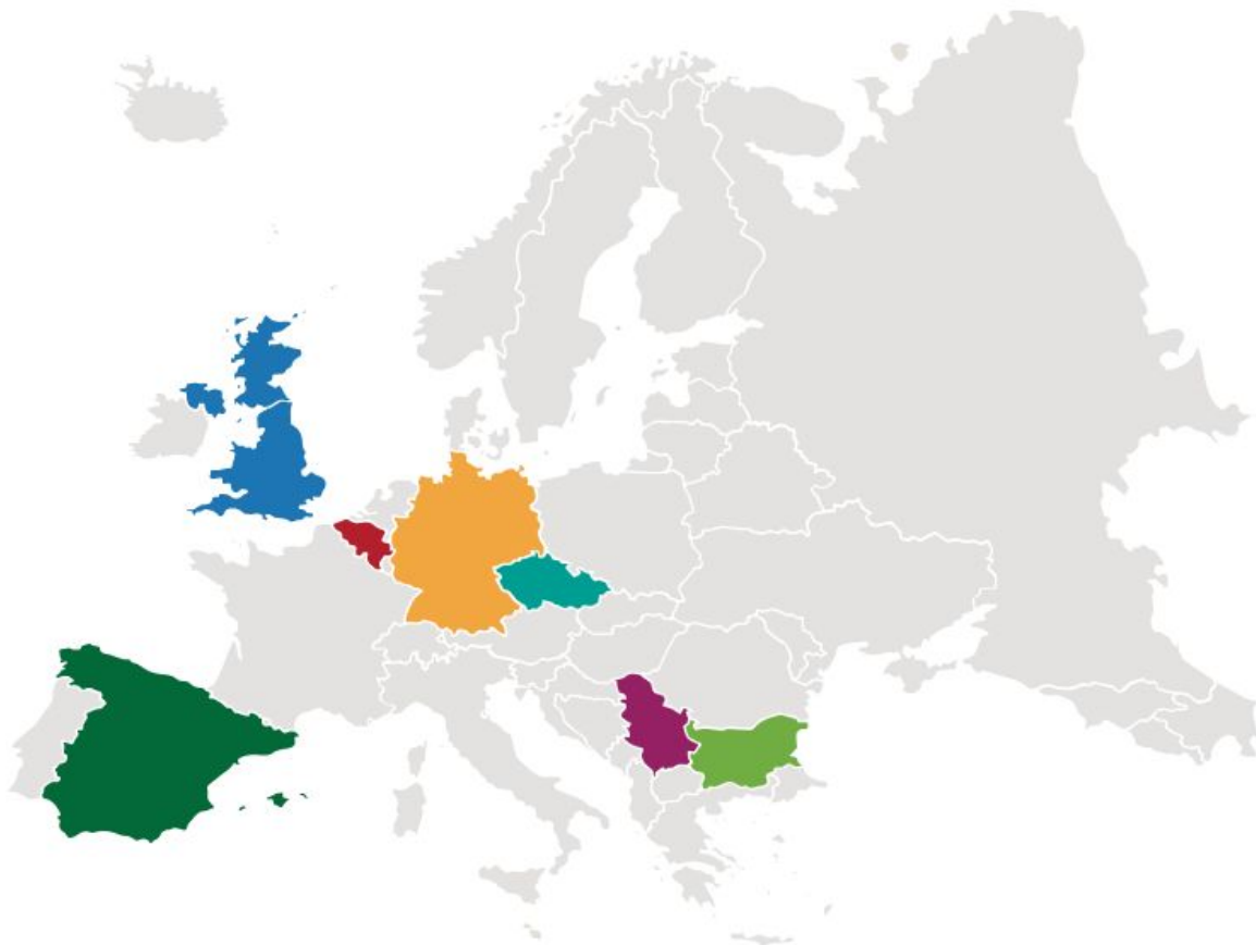
Figure 2: BESTMAP.eu interactive map with partners

Whenever a particular country is selected, a list of all local partners and their short description is shown. This enables the user to easily get to know all project beneficiaries.